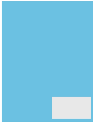
1/8 PAGE HORIZONTAL 3.825" x 2.625"