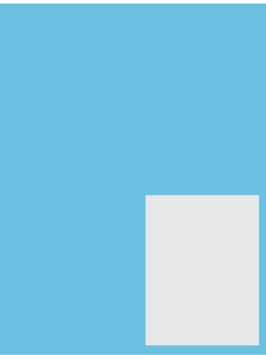
1/4 PAGE HORIZONTAL 3.875" x 4.875"